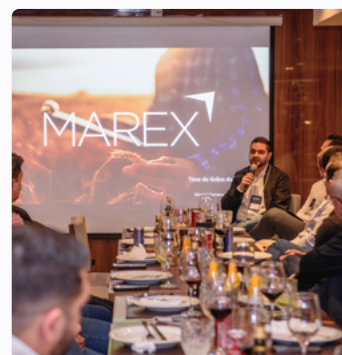
Grains Clients Engagement Dinner Campinas, Brazil