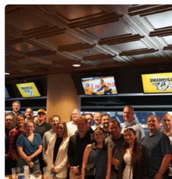
NORAM Customer Appreciation Event Nashville, TN