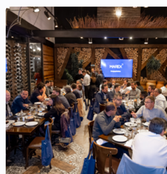
Coffee Clients Engagement Dinner Cascavel, Brazil