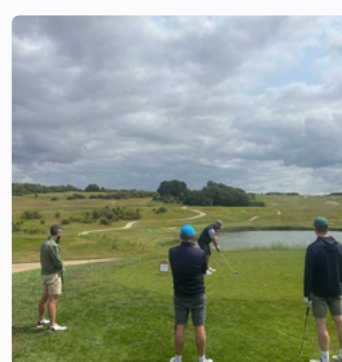
London Golf Club London, UK