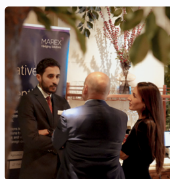
International Energy Week Bruch London, UK